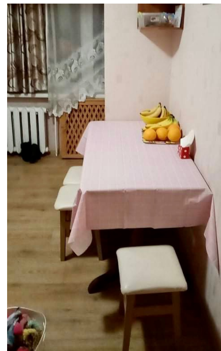
Pictured above is a studio apartment RLS helped a single mom move into.

We have a burden for our sister-ministry in Romania, but have not been able to help in several months. We partner with the director of a rural school that houses